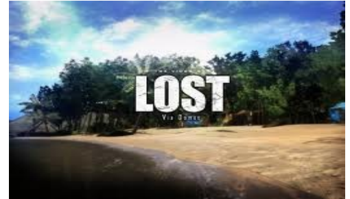
Lost on an Island