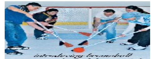
Ice rink hockey