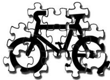
Bicycle build for charity